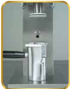
Anticorodal aluminium moulds. Spaghetti mould included