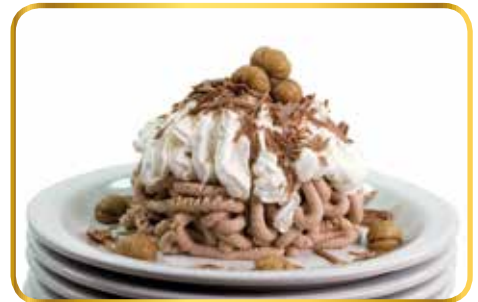
An example realized with "Spaghetti" mould