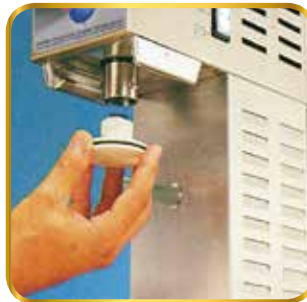
Easily removable Makrolon ® piston for a perfect cleaning